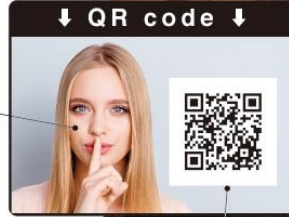
Variable Barcode Print (optional)

Digital White print for free and rich creative! Free ganging without the limit of white plate